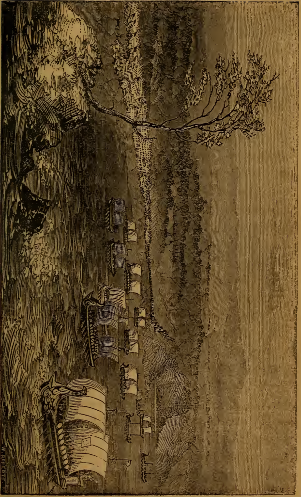
THE LANDING IN ENGLAND.